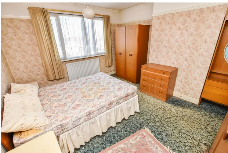
Bedroom One 13'2 x 11'9 (4.01m x 3.58m)

Upvc double glazed window to front aspect, carpet, picture rail, artex ceiling, radiator, TV and power points.