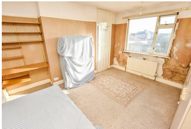
Bedroom Two 13'1 x 11'4 (3.99m x 3.45m)

Upvc double glazed window to rear aspect, carpet, artex ceiling, storage cupboard housing boiler (installed 2021), radiator, TV and power points.