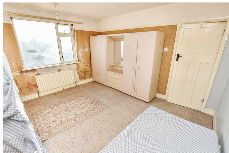
Bedroom Three 9'2 x 6'11 (2.79m x 2.11m)

Upvc double glazed window to front aspect, carpet, picture rail, artex ceiling, radiator, TV and power points.